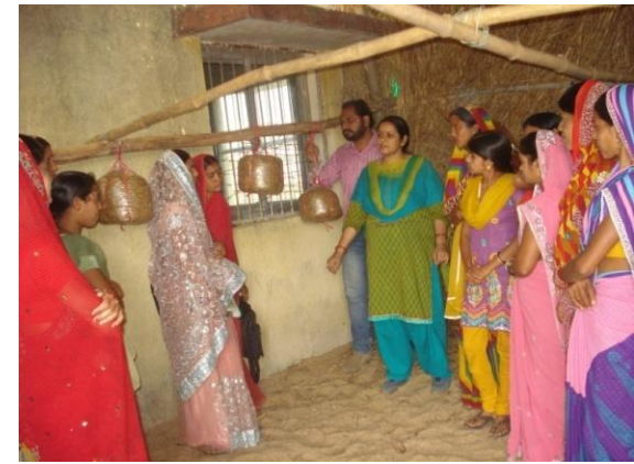
Vocational Training Programme on Mushroom Spawn Production