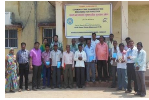
Training programme on community tank management for fish seed production sponsored by NFDB, Hyderabad