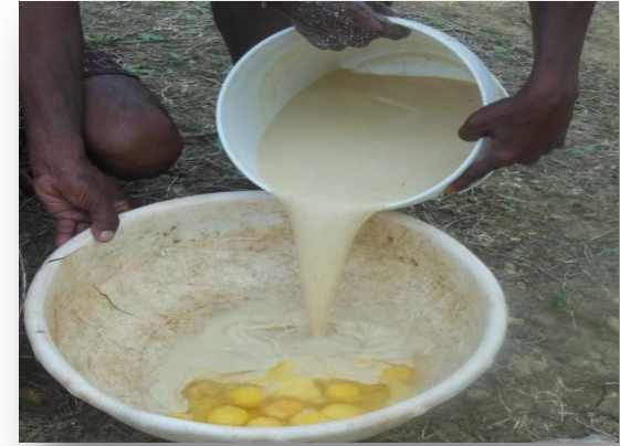
On farm trial on farmers field